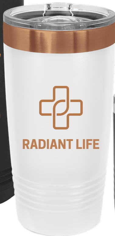
CM711WHRG 20 oz. Tumbler