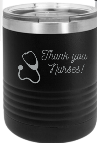
CM816* 10 oz. Tumbler