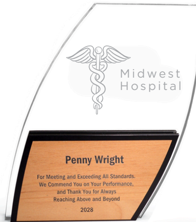
CD1275 Skewed Success Acrylic Award