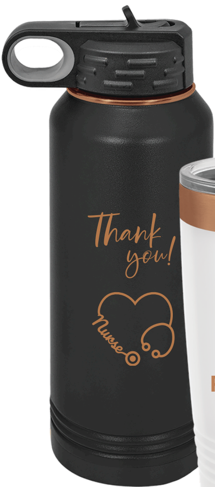
CM731BKRG 32 oz. Travel Bottle