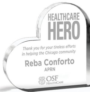
CD1296 & CD1295 Contempo Heart Acrylic Award