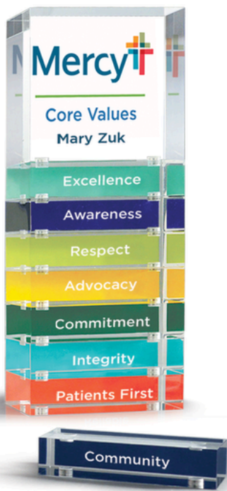
CD1008 & CD1075C Magnetic Stackable

Honor your healthcare heroes with thoughtful awards and gifts that celebrate their dedication. Create meaningful recognition for your team of healthcare workers that truly reflects their hard work.