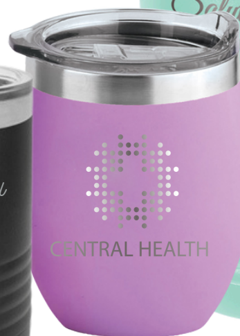
CM745* 16 oz. Stemless Tumbler