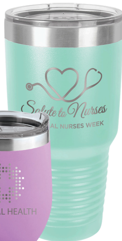
CM710* 30 oz. Tumbler